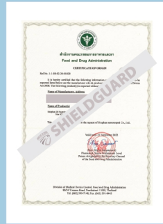
Certificate of Origin