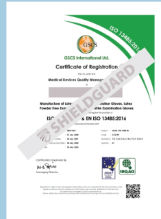
EN ISO 13485